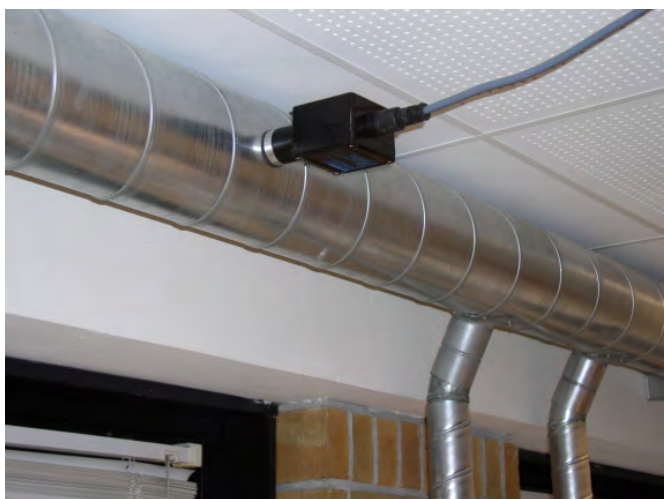
Example of duct mounting with GP-CO2 detectors